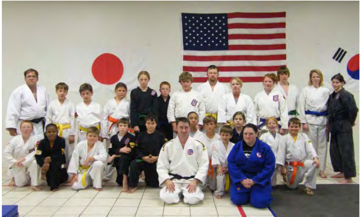
Some of the attendees at the clinic at D'Arbonne martial arts.